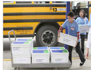
Students collecting books for new babies in their community.

In schools of character, teachers and administrators work together with parents and community members to positively shape the social, emotional and character development of young people. Here students